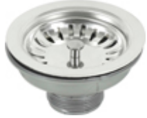
Basket Waste Strainer 15 L/min Rating, Suits 5901 ZZ