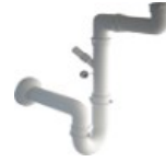
Spazio plumbing Kit Single