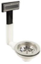
Basketwaste & Rect. Overflow Kit, 15 L/min Rating (HCO) [NB. add 1 x 20.5904.ZZ for Arizona bowls]