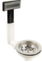
Basketwaste & Rect. Overflow Kit, 15 L/min Rating (HCO) [NB. add 1 x 20.5904.ZZ for Arizona bowls]