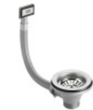
Basketwaste & Designer Overflow, suits badge type overflow