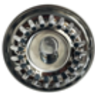
Basketwaste Strainer, SS, Suits badge type overflow (9427)