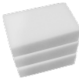
EcoGranit Cleaning Sponge