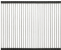
Hot Mat, Stainless Steel