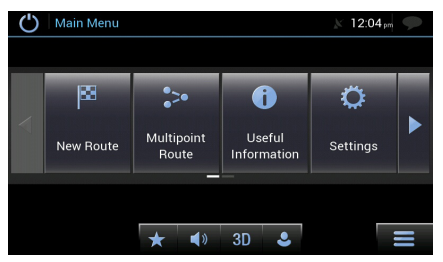
Customised User Interface

The software package in this Navigation system is called NextGen and it's known to be intuitive and extremely easy to use. The user interface is clear, easy to read and the menus are simple to navigate.