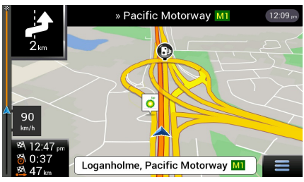
Safety Proximity Alerts

The extensive "Points of Interest" database makes it easy to find Petrol Stations, Emergency Services, ATMs and more at your current location, along your route or around your destination.