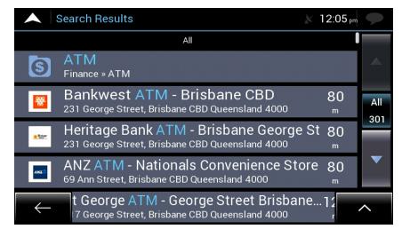
"Points of Interest" (POI)

Real Signpost Rendering, Enhanced Junction View and Tunnel Mode help make travelling a breeze! They show you what to look for and where to go, so you can easily navigate through areas and intersections you're unfamiliar with.