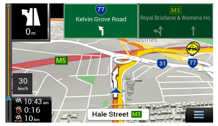
Real Signpost Rendering

The software package in this Navigation system is called NextGen and it's known to be intuitive and extremely easy to use. The user interface is clear, easy to read and the menus are simple to navigate.